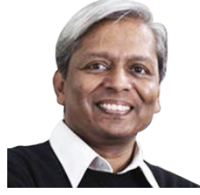
K. VijayRaghavan Secretary Department of Biotechnology